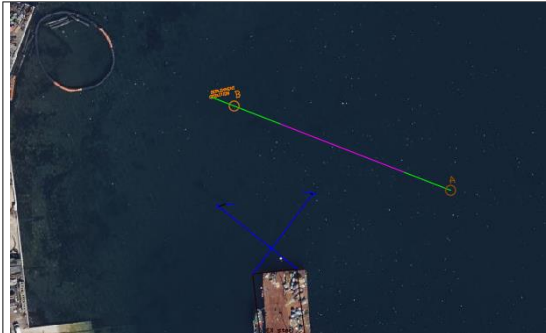
Figure 2 Wave Attenuation as Laid Positions.